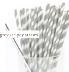
Box of 25 grey stripy straws Pipii £2.55//$4