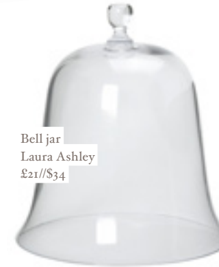
Bell jar Laura Ashley £21//$34