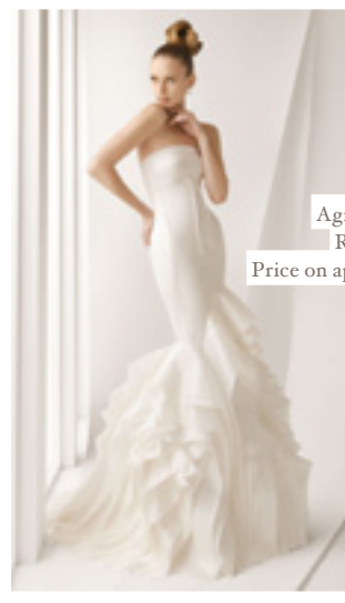
Agnes Gown Rosa Clara Price on application