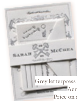
Grey letterpress invitations Aerialist Press Price on application