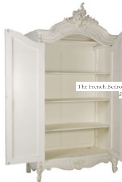
Armoire The French Bedroom Company £1,300//$2,080

Channel Caitlin & Shea's Southern chic with these beautiful pieces